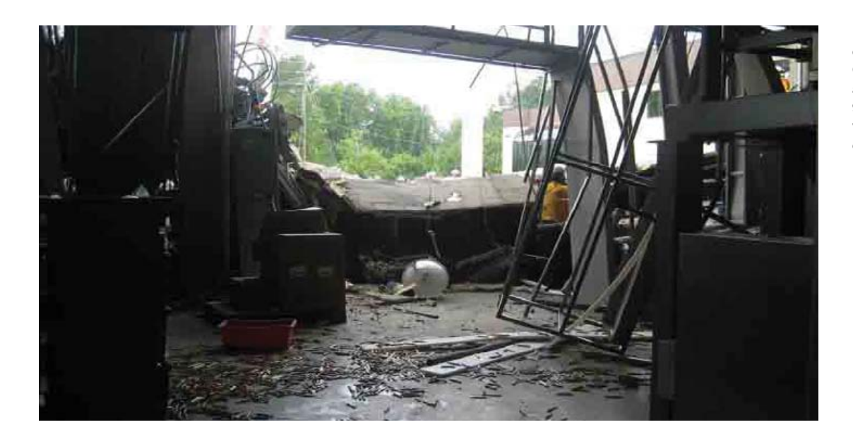
12 Investigative staff deployed to the ConAgra plant after an explosion on June 9, 2009 that killed 4 workers and injured dozens of others.

consequences and preliminary understanding of the potential causes and analyzed according to several factors such as the severity of injuries, property losses, and offsite impacts. The factors are scored numerically and