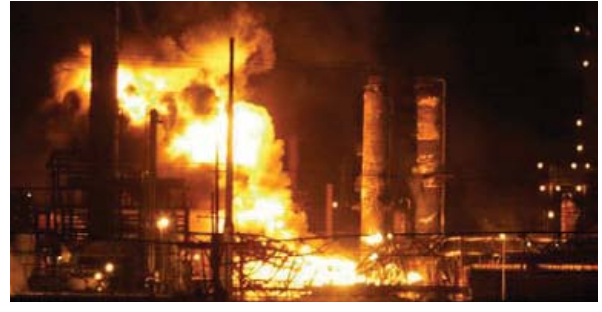
Liquefied petroleum gas fire at Valero's Mckee Refinery near Sunray, TX, February 16, 2007

GOAL 3: Preserve the public trust by maintaining and improving organizational excellence.