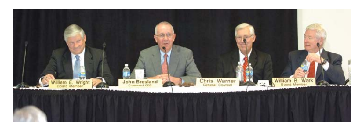
CSB Board Members and General Counsel at the 2009 Bayer CropScience public meeting in Institute, WV.

underlying causes such as inadequacies in safety management systems and safety culture, and opportunities for improving regulatory standards and enforcement. The CSB makes safety recommendations to regulatory agencies, companies, industry organizations, standard-setting bodies, first responders, and labor groups.