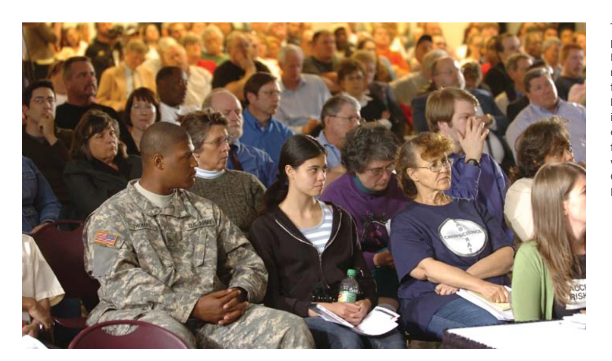
The CSB's 2009 public meeting in Institute, WV, to release preliminary findings on the board's investigation into the fire and explosion that fatally injured two workers at the Bayer CropScience facility in Institute, WV.