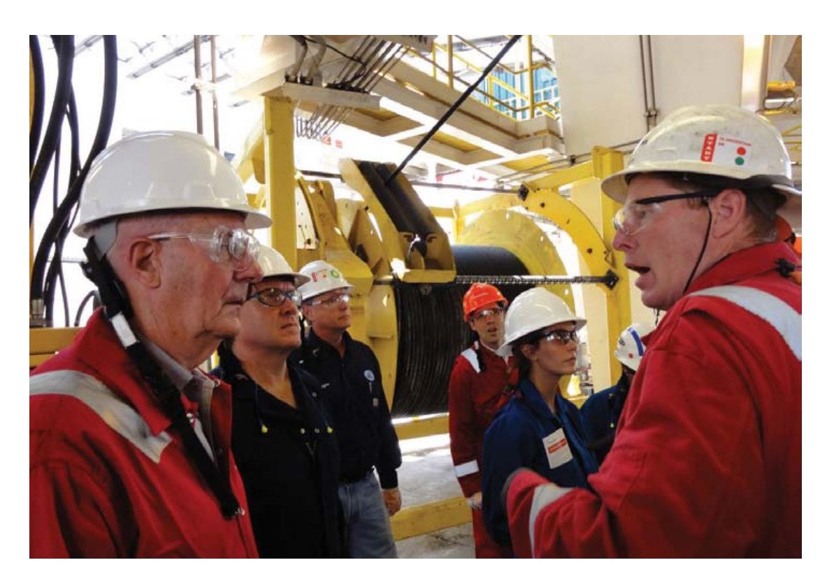
CSB Board Member and Investigators Tour Offshore Oil Rig

teams, providing input in the report development process, voting on final CSB products and recommendations and advocating for safety recommendations. The CSB's enabling language provides that board members be appointed based on technical qualifications, professional standing, and demonstrated knowledge of incident reconstruction, safety engineering, human factors, toxicology, and air pollution regulation.