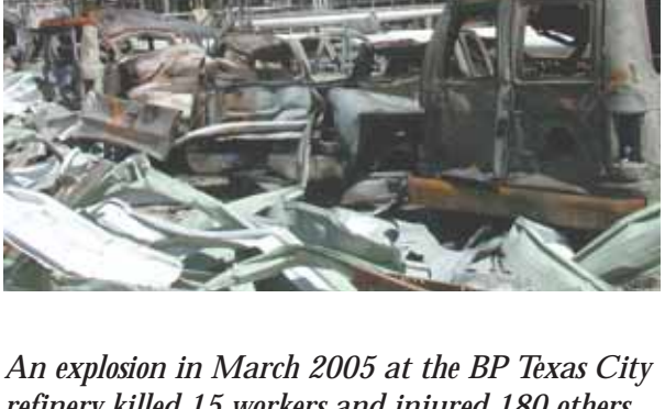
An explosion in March 2005 at the BP Texas City refinery killed 15 workers and injured 180 others. The CSB deployed an investigation team to this accident and has issued urgent recommendations concerning trailer siting and safety culture.

The CSB's three urgent safety recommendations issued in 2005 from the Texas City investigation are already prompting major changes throughout the industry. For example, new policies are being implemented in the U.S. and overseas for placing temporary structures such as trailers away from hazardous areas of petrochemical facilities.