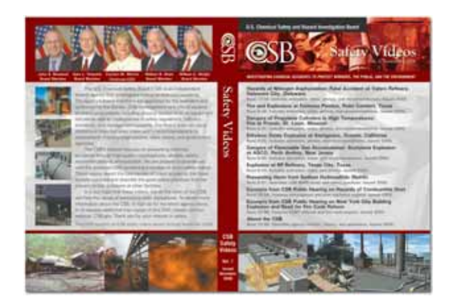
The CSB Safety Videos DVD details recommendations issued from recent CSB investigations in a series of short videos.

In the past several years, the CSB has moved toward virtually 100% electronic dissemination of all its information. The CSB's website, CSB.gov, is an internationally recognized resource for accident prevention that receives more than one million hits annually. The site, which was completely redesigned in 2003, is the agency's principal interface with the public. The Strategic Plan envisions continued investment in the website to maintain its currency, including state-of-the-art technologies such as imbedded streaming video. As technologies evolve we will utilize those new technologies to extend the dissemination of CSB safety findings.