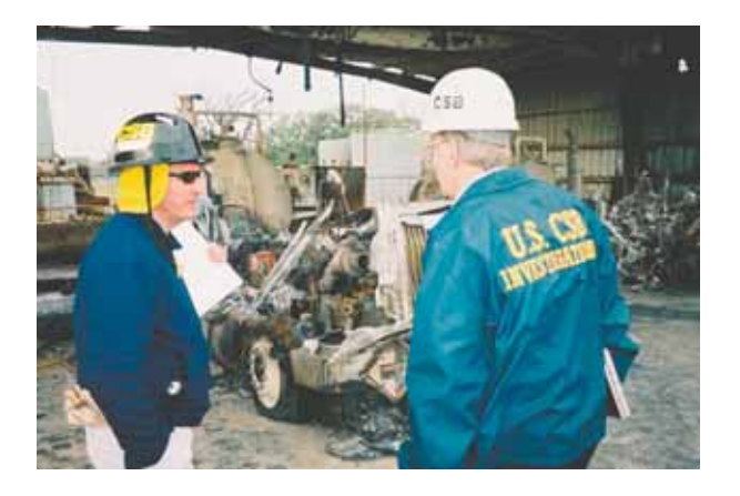
Members of a CSB investigation team survey the scene of a fatal vapor cloud fire in Rosharon, Texas.

eligibility for retirement, succession planning takes on heightened importance. Developing plans for replacing key investigative and administrative functions will be an important exercise during the current period.