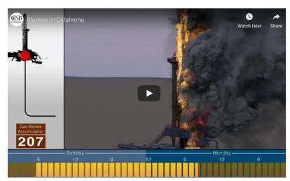
Animation still from "Blowout in Oklahoma."