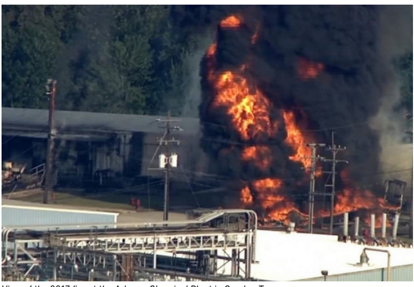
View of the 2017 fire at the Arkema Chemical Plant in Crosby, Texas

On August 31, 2017, fires erupted at the Arkema Chemical Plant in Crosby, Texas, as a result of heavy rain from Hurricane Harvey. Plant equipment flooded and failed, causing chemicals stored at the facility to decompose and burn, releasing fumes and smoke into the air. Twenty-one people sought medical attention from reported exposures to the fumes. More than 200 residents living near the facility was evacuated and could not return home for a week.