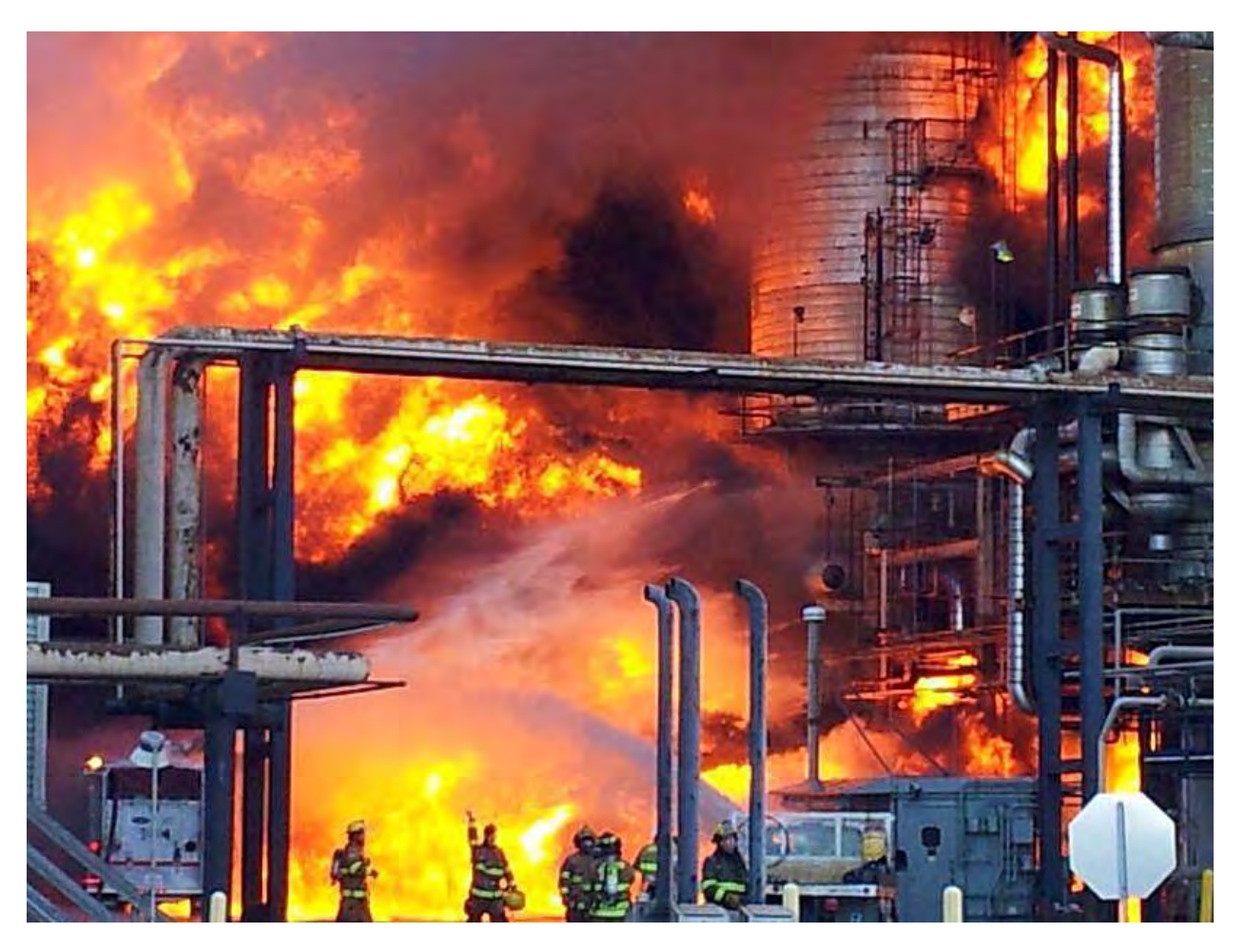
CHEVRON RICHMOND REFINERY #4 CRUDE UNIT