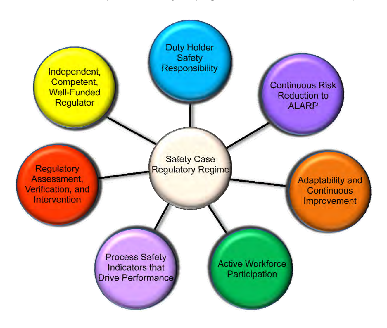
Figure 1. Safety Case Attributes.