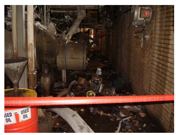
Figure 1. Area of fatality

Several hours later, after plant operations had resumed, a supervisor assessing damage in the immediate incident area discovered the body of a Goodyear employee located under debris in a dimly lit area (Figure 1).