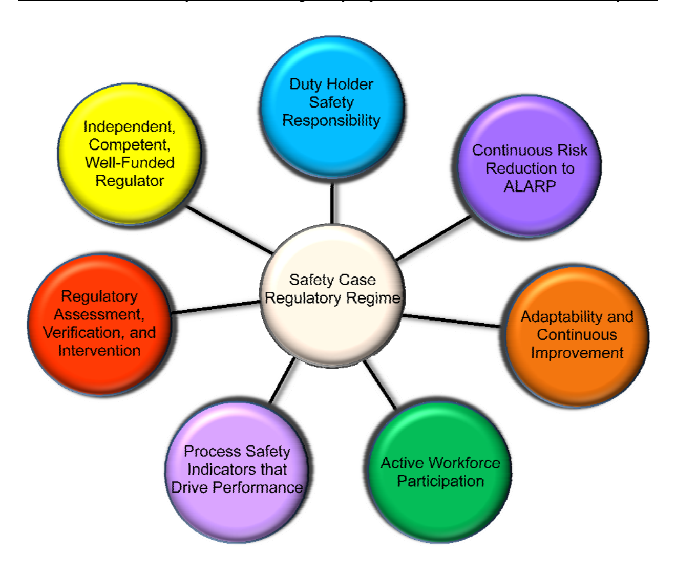
Figure 1. Safety Case Attributes.