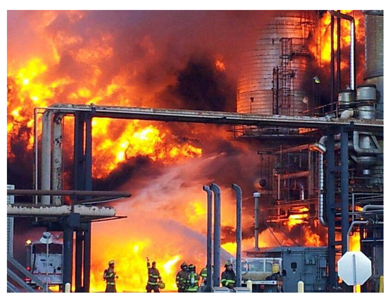
CHEVRON RICHMOND REFINERY #4 CRUDE UNIT