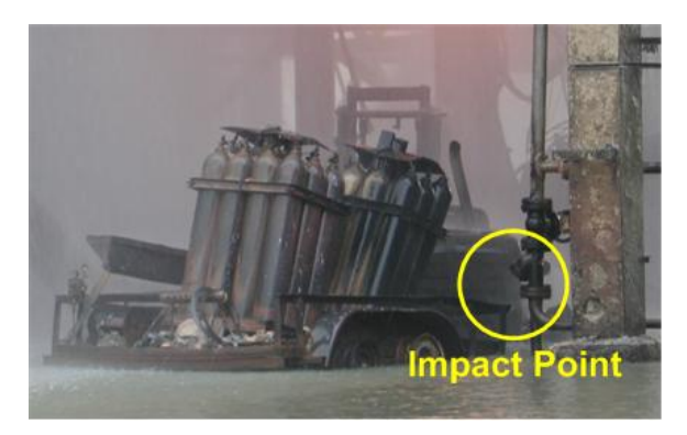
Figure 10. Vehicle impact point.

The contrast between the physical protection for firefighting equipment and the administrative provisions for process piping and other equipment is striking. Figure 9 shows the protection afforded firefighting equipment, while Figure 10 shows the lack of protection where the impact and release occurred.