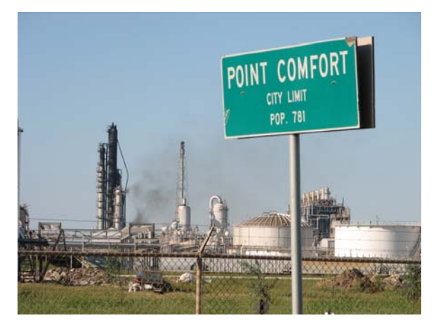
Figure 2. View of the Damaged Plant from Highway 35.

The Red Cross assisted employees and contractors at the Port Lavaca Community Center. More than 20 local residents sought medical evaluation at local hospitals, but none were admitted.