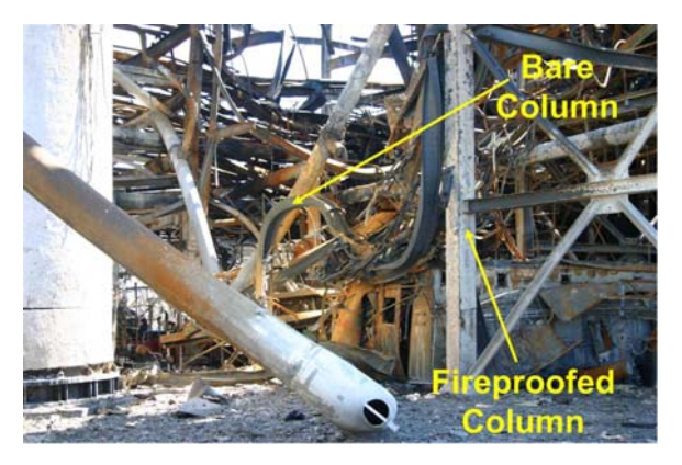
Figure 7. Fireproofed and bare steel support columns.

Passive fire protection (fireproofing<sup>9</sup>) was installed on only three of four support column rows and the columns that supported the pressure relief valves and emergency vent piping had no fireproofing (Figure 7). The bare steel columns bent over, while the fireproofed columns remained straight.