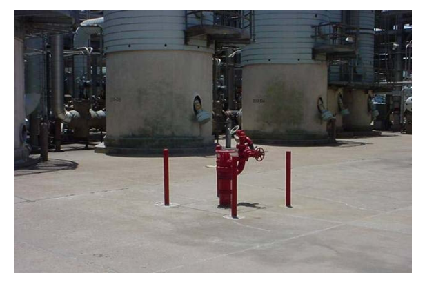
Figure 9. Protection of fire fighting equipment.

During the facility siting analysis, the hazard analysis team discussed what might occur if a vehicle (e.g., fork truck, crane, man lift) impacted process piping. While the consequences of a truck impact were judged as "severe," the frequency of occurrence was judged very low (i.e., not occurring within 20 years), resulting in a low overall risk rank.<sup>11</sup> Because of the low risk ranking, the team considered existing administrative safeguards adequate and did not recommend additional traffic protection.