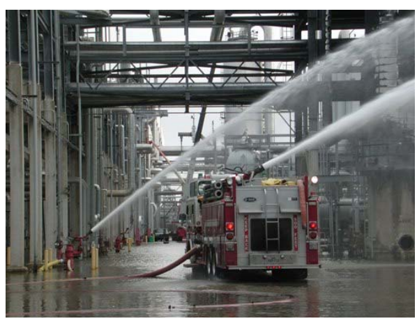
Figure 5. Formosa ERT equipment.

• The Formosa ERT arrived and took command of the incident response (Figure 5).