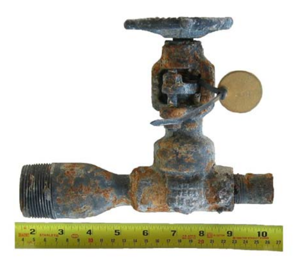
Figure 4. Valve and pipe.

• Pressurized liquid propylene (216 psig) rapidly escaped through the opening and