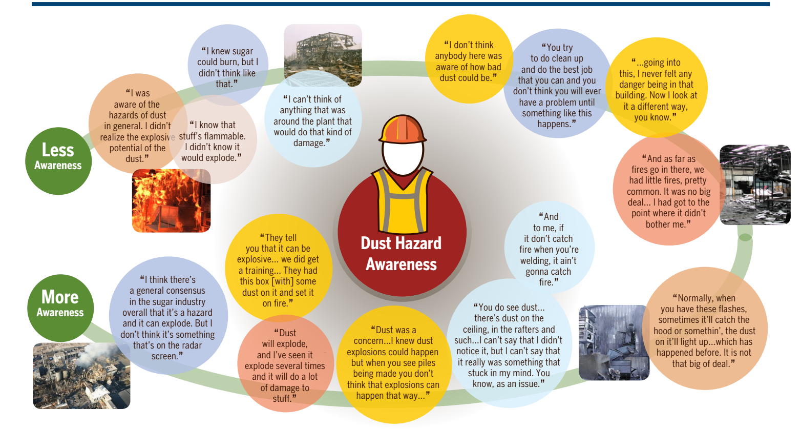
Figure 1. Interview excerpts of employee perceptions of dust hazards from Didion and prior CSB combustible dust investigations. Each quote bubble color represents a separate incident.