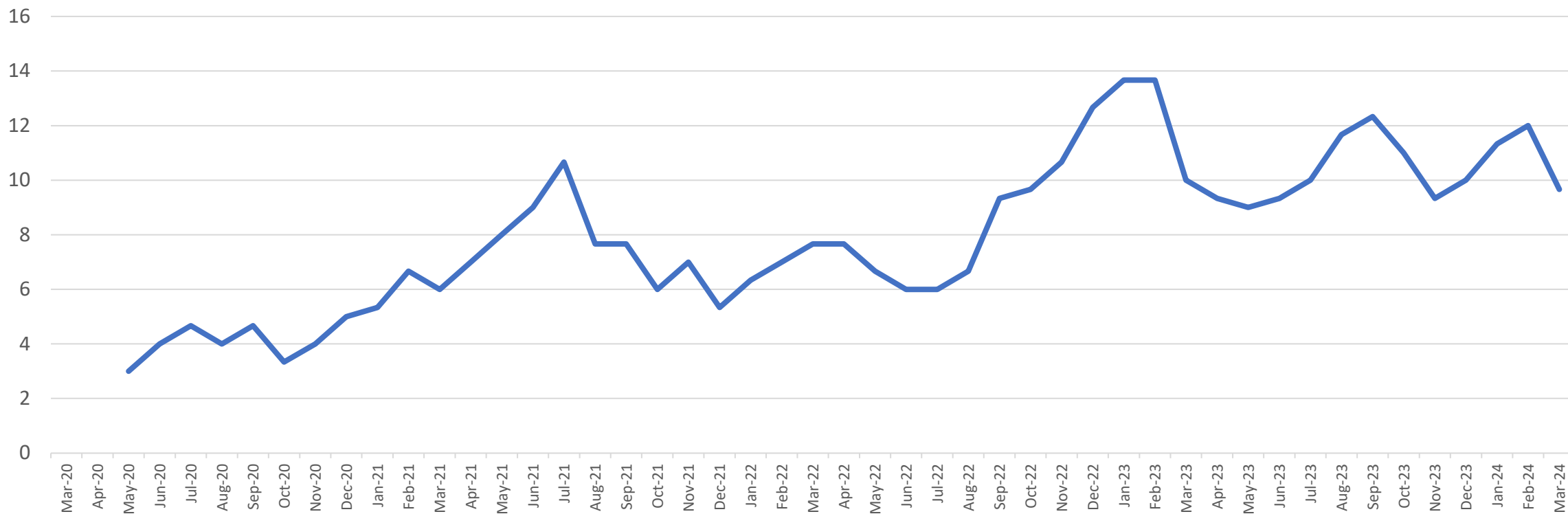
Accidental Release Events 3-Month Moving Average