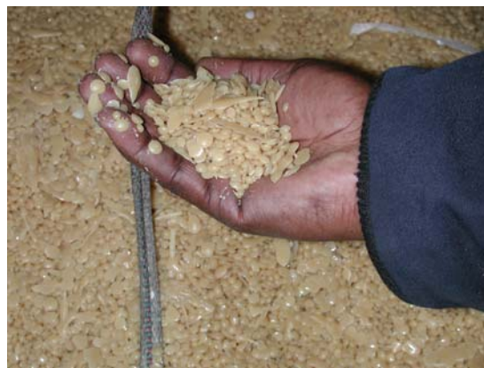
Figure 3. Wax Pellets from Processed Rag

Operators used the nitrogen system to pressurize Tanks 6 and 7 to force the liquid rag through an elevated section of pipe connected to the process unit feed pump. The rag was pumped through the process unit to remove residual hydrocarbons. The refined rag was solidified into small pellets (Figure 3), packaged, and shipped.