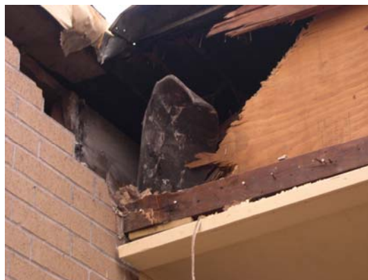
Figure 7. 20-pound Tank 7 fragment embedded in building wall 300 feet from the Marcus Oil property line.