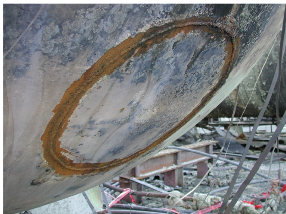
Figure 4. 24-inch patch plate on Tank 8.

Tanks 5 and 6 were essentially the same. Although the Tank 7 patch plate was not recovered, CSB investigators concluded that it matched the other three tank patch plates.