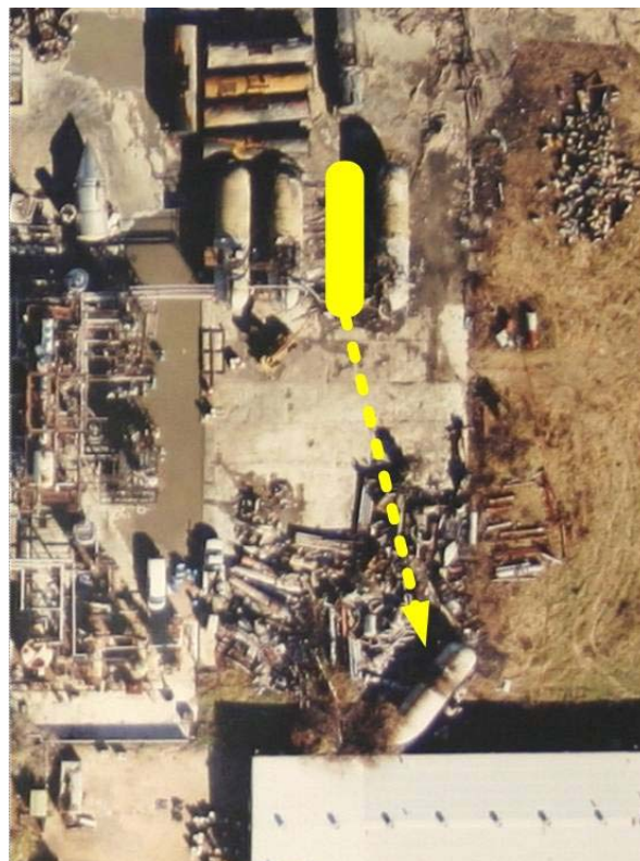
Figure 1. Explosion displaced Tank 7 more than 150 feet.

Tank 7, a 12-foot diameter, 50-foot long, 50,000-pound pressure vessel was propelled 150 feet where it impacted a warehouse