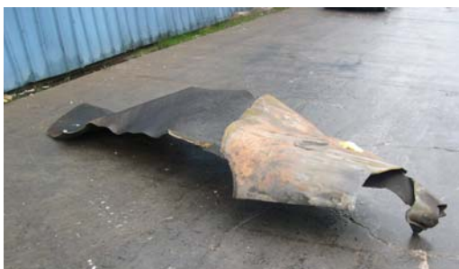
Figure 6. 750-pound Tank 7 fragment landed near employees.