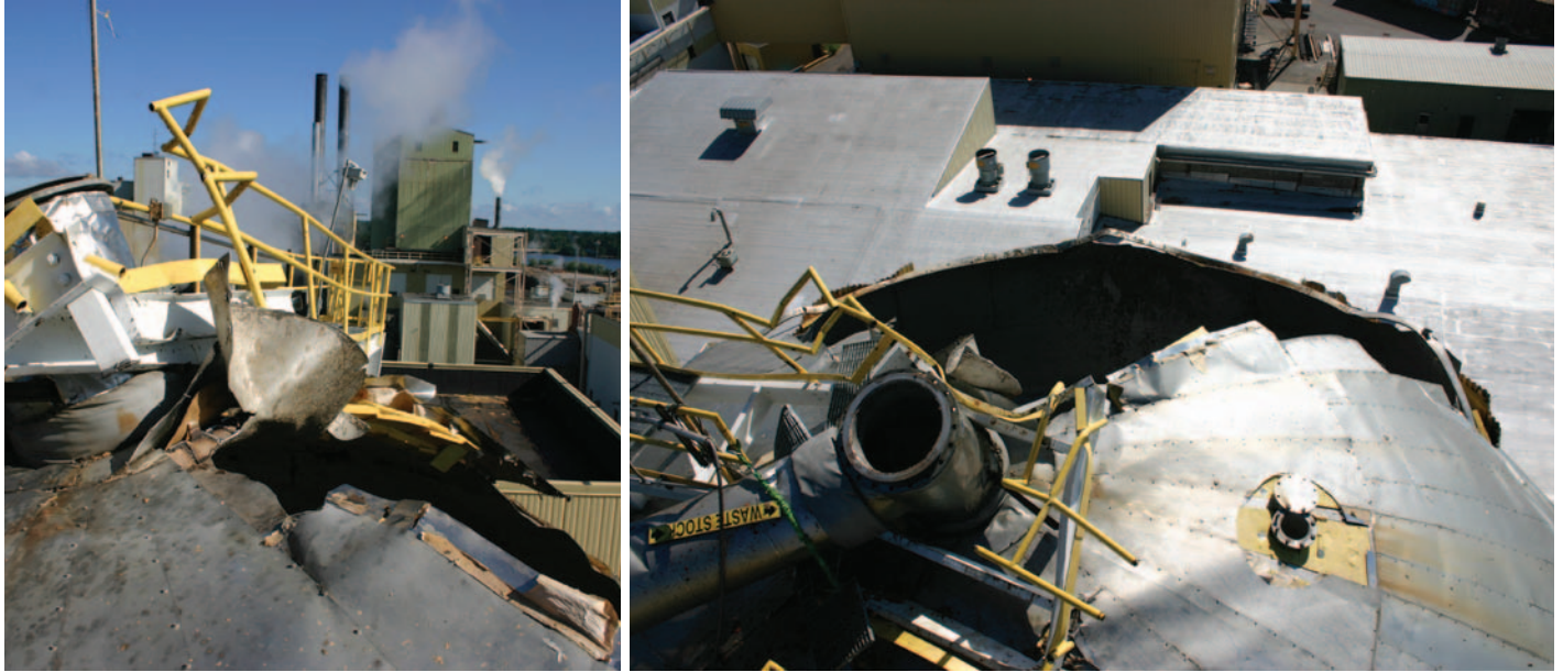
Views of the storage tank involved in the 2008 explosion at Packaging Corporation of America.