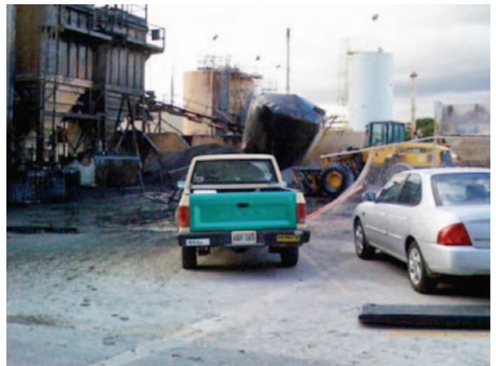
View of Philip Services Corporation following a October 7, 2008, waste oil storage tank explosion.

According to the HFD investigation, a PSC official asserted that the contractors were not authorized to weld within the dike area surrounding the tank, a hot work permit had not been issued for the welding, and combustible gas monitoring was not conducted. Conversely, the contracting company's personnel asserted that they believed that the work was authorized and that PSC had conducted combustible gas monitoring prior to the welding activity.