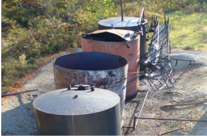
Oil storage tanks involved in fire and explosion at MAR Oil.