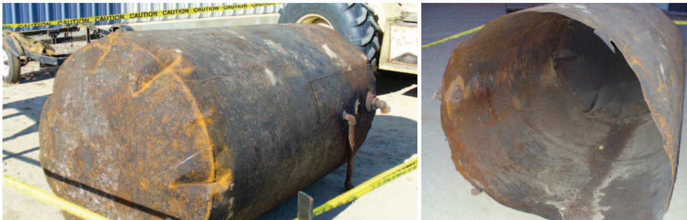
Exterior and interior views of the fuel tank involved in the hot work accident at A.V. Thomas Produce.

evaluation and the proper use of gas monitoring equipment likely would have alerted workers to the unsafe work conditions.