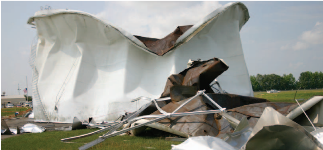
The gasoline storage tank at the TEPPCO McRae Terminal following the 2009 hot work accident that killed three workers.

gas monitoring are performed improperly. The ineffective hazard assessment and monitoring practices used in these cases failed to identify the presence of a flammable atmosphere in the area where hot work was being conducted.