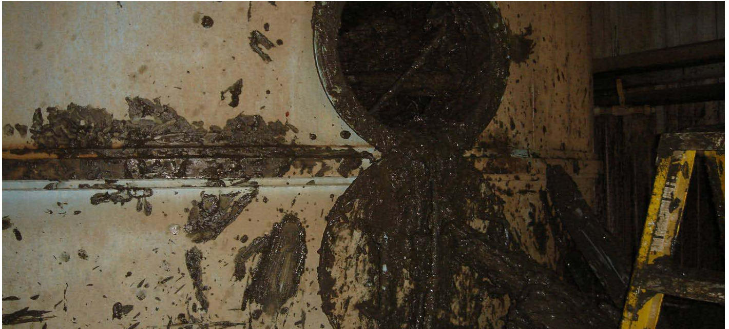
Potato-washing tank involved in the February 2009 accident at ConAgra Foods.