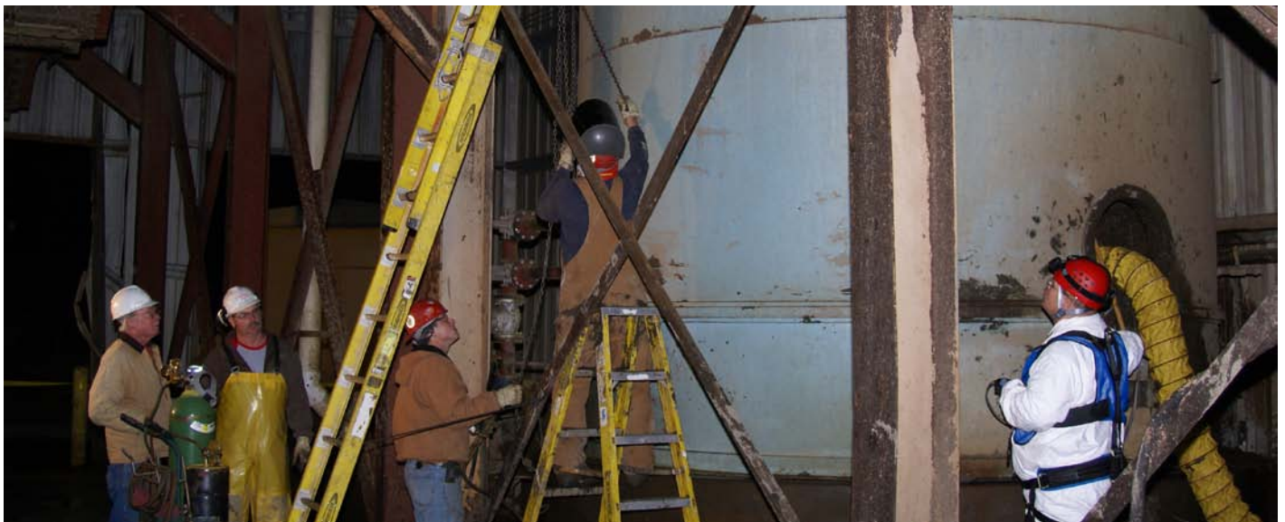
Rescue efforts following the February 16, 2009, hot work accident at ConAgra Foods in Boardman, Oregon.

Occupational Safety and Health Administration (OSHA). General Requirements for Welding, Cutting, and Brazing , 29 CFR 1910.252.