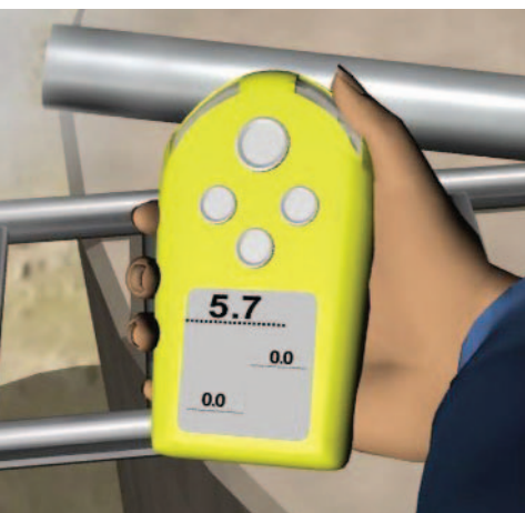
Example of a combustible gas detector used to test for the presence of flammable gas or vapor.

The 11 incidents are divided into two categories: 1) those cases where no gas monitoring was conducted; and 2) those where gas testing was improperly conducted.