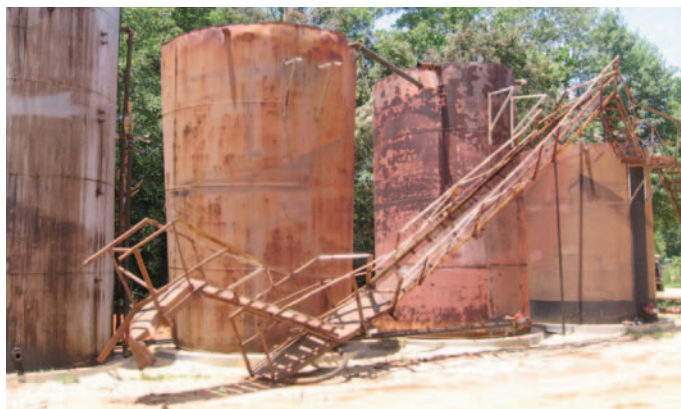
Tanks involved in the 2006 accident that killed three workers at the Partridge-Raleigh Oilfield.

Neither the contract company nor Partridge-Raleigh required written hot work permits. The contractor company did not provide hot work safety training to employees. Furthermore, Partridge-Raleigh did not have safety requirements for its oilfield contractors.