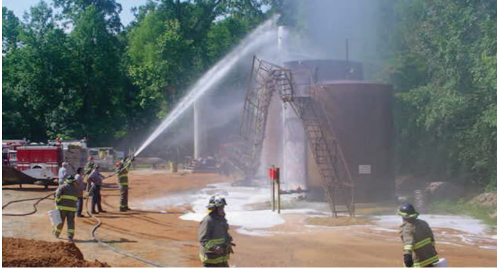
Emergency response efforts following a June 5, 2006, accident at the Partridge Raleigh Oilfield.