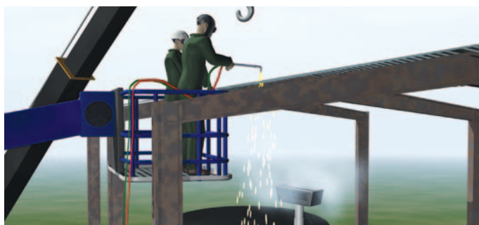
Depiction of hot work from the CSB's 2007 "Public Worker Safety" video illustrating the accident at Bethune Point.

Daytona Beach public employees were not covered by OSHA standards, which is typical for local and state governments in a number of jurisdictions. The city had no formal permitting system for hot work or non-routine maintenance activities, and workers had not received any training on methanol hazards in the previous 10 years. Combustible gas monitoring was not performed or required.