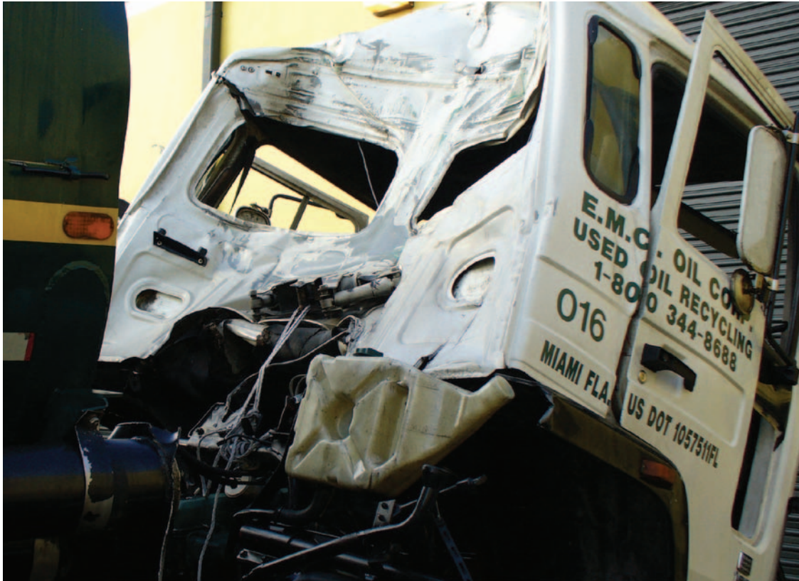
Damage to an oil tanker sustained from the December 2, 2008, explosion at EMC Used Oil Corporation.