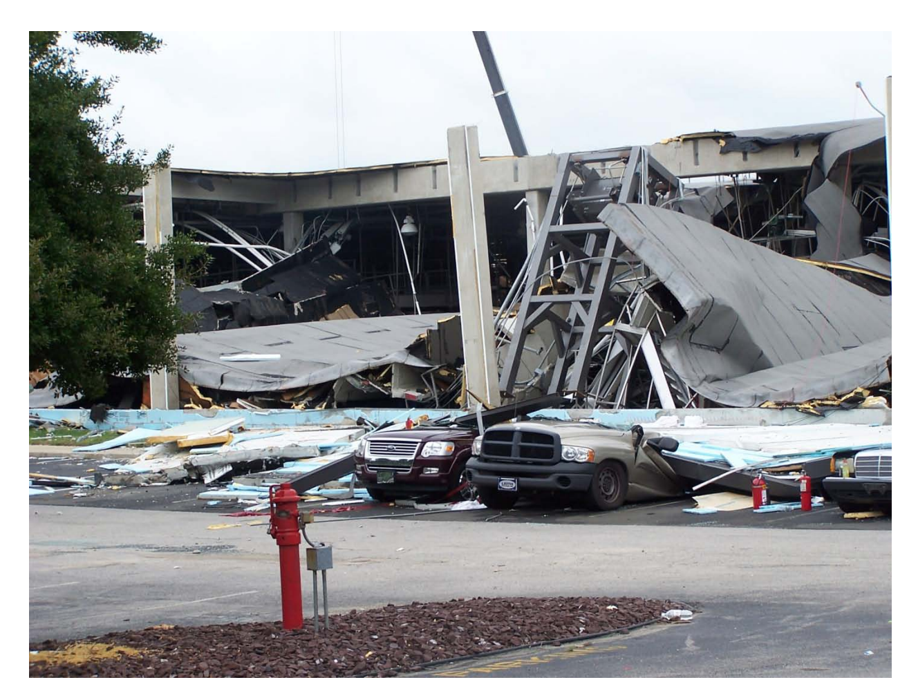
Figure 2. ConAgra Slim Jim meat processing plant in Garner, North Carolina, following the natural gas explosion of June 9, 2009, which killed 4 workers, injured 67 others, and caused much of the building to collapse.