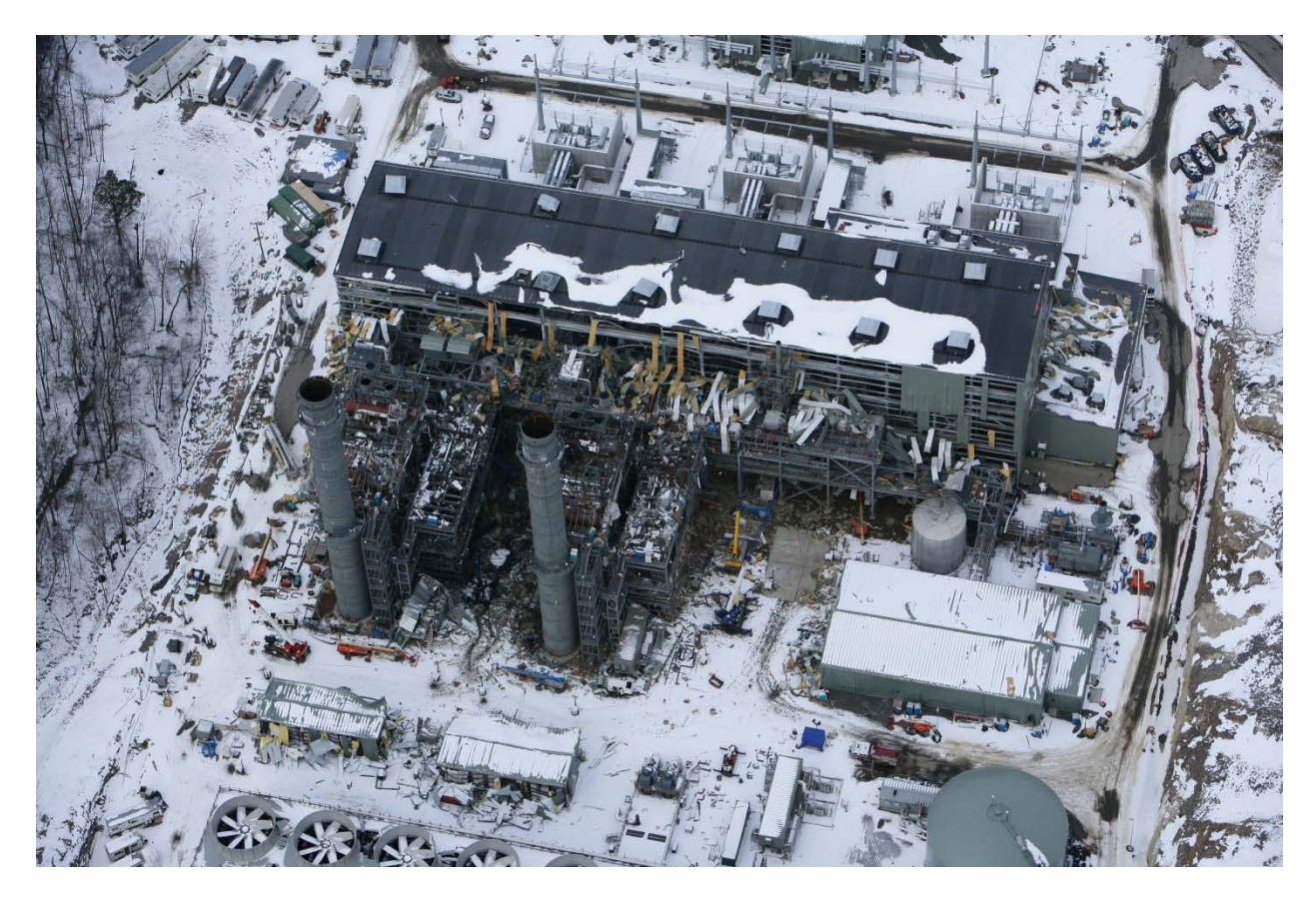
Figure 1. Aerial photograph taken shortly after the devastating gas explosion February 7, 2010, at the $1 billion Kleen Energy power plant in Middletown, Connecticut.