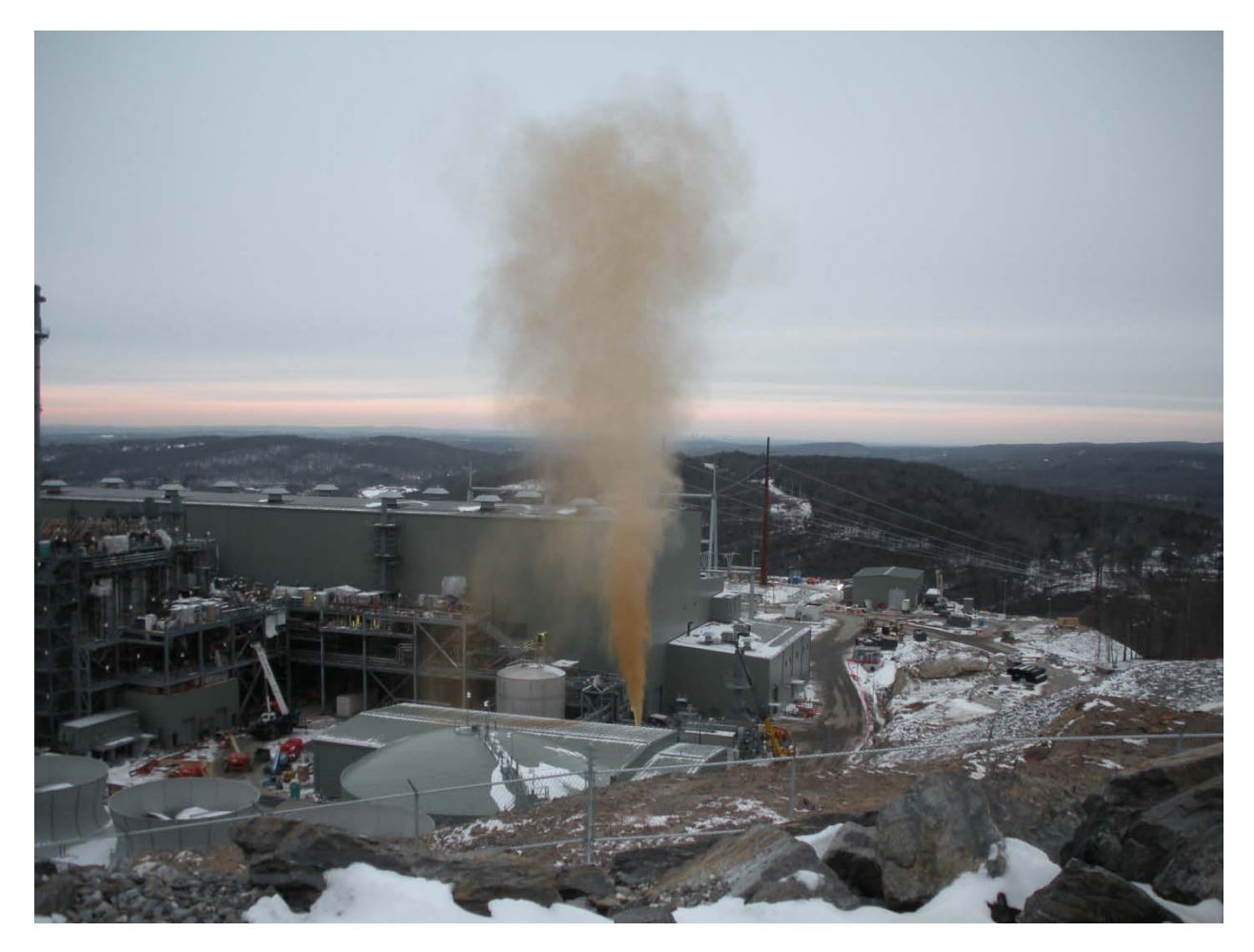
Figure 3. Natural gas blow conducted at the Kleen Energy plant a week prior to the explosion on February 7, 2010, showing plume of gas and debris hundreds of feet high.