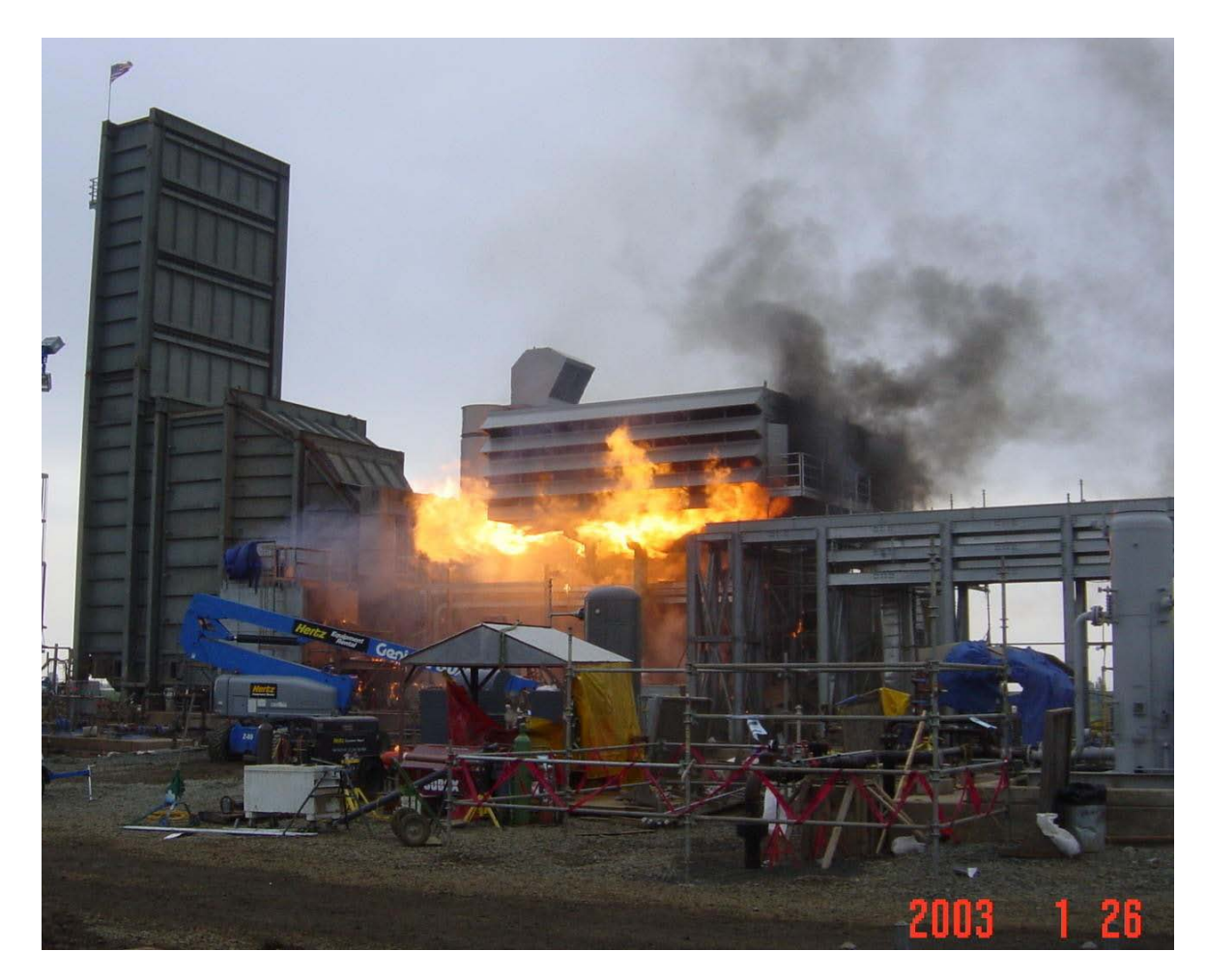
Figure 4. Previous explosion during a natural gas blow on January 26, 2003, at a Calpine natural gas power plant in Fairfield, California. The explosion was heard 10 miles away.