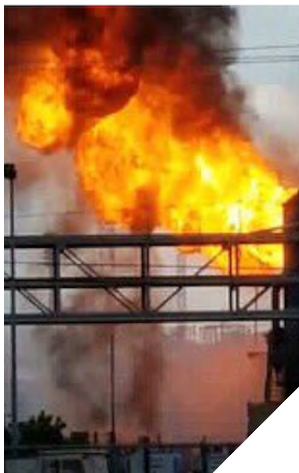
Figure 1. Fire at Kuraray EVAL Plant. The photo on the left shows the fire from a local road. The photo on the right is an image from a video of the fire.

On May 19, 2018, at approximately 10:30 a.m., during preparations for startup activities following a turnaround, 1 a fire occurred at the Kuraray America EVAL facility in Pasadena, Texas. At the time of the incident, 266 employees and contract workers were onsite. During pre-startup pressure-testing activities of a chemical reactor, an abnormal high-pressure condition occurred and over 2,000 pounds of ethylene 2 were released to the atmosphere from a pressure relief valve. The ethylene vapors ignited ( Figure 1 ), resulting in worker injuries. Twenty-one injured workers were transported to off-site medical facilities for treatment. 3