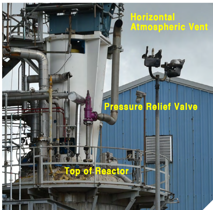
Figure 2. The pressure relief system that activated and discharged ethylene horizontally across the road.

process. This process is highly dependent on temperature and pressure. The polymerization reaction generates heat that is controlled using two cooling systems: a reactor jacket 7 that uses cooling water, and reactor cooler system that uses a refrigerated solution of water and methanol, commonly referred to as “brine” by Kuraray EVAL personnel. 8