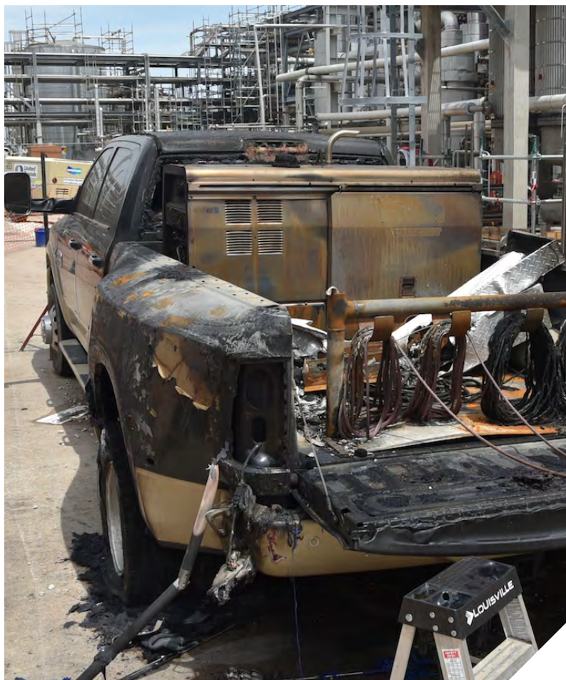
Figure 3. The welding machine that was the source of ignition, located under the relief valve's horizontal discharge.

Office identified the ignition source as “located in or around the operating welder [welding machine] located in the back of the Dodge pickup” (right photo in Figure 3 ), located adjacent to the reactor structure, under the relief valve discharge piping (left photo in Figure 3 ). Contract workers in the vicinity of the fire were performing a variety of activities including welding, insulating, and painting. These workers immediately evacuated when the fire erupted. Some workers suffered burns or were injured by jumping from heights or falling while running to escape the fire. The fire burned for