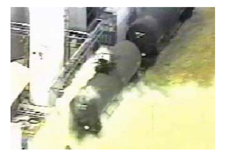
Figure 1. August 14, 2002, chlorine release at DPC Enterprises in Festus, Missouri

This bulletin compares two chlorine releases investigated by the CSB. In both, a railcar unloading hose failed and chlorine was released. In the first incident, an emergency shutdown system malfunctioned, resulting in a release of 48,000 pounds of chlorine and a significant community impact. In the second, the emergency shutdown system worked to minimize the release, and the community was not impacted.