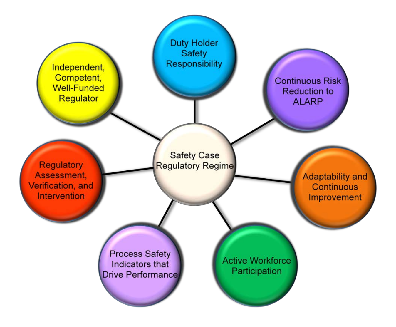
Figure 1. Safety Case Attributes.