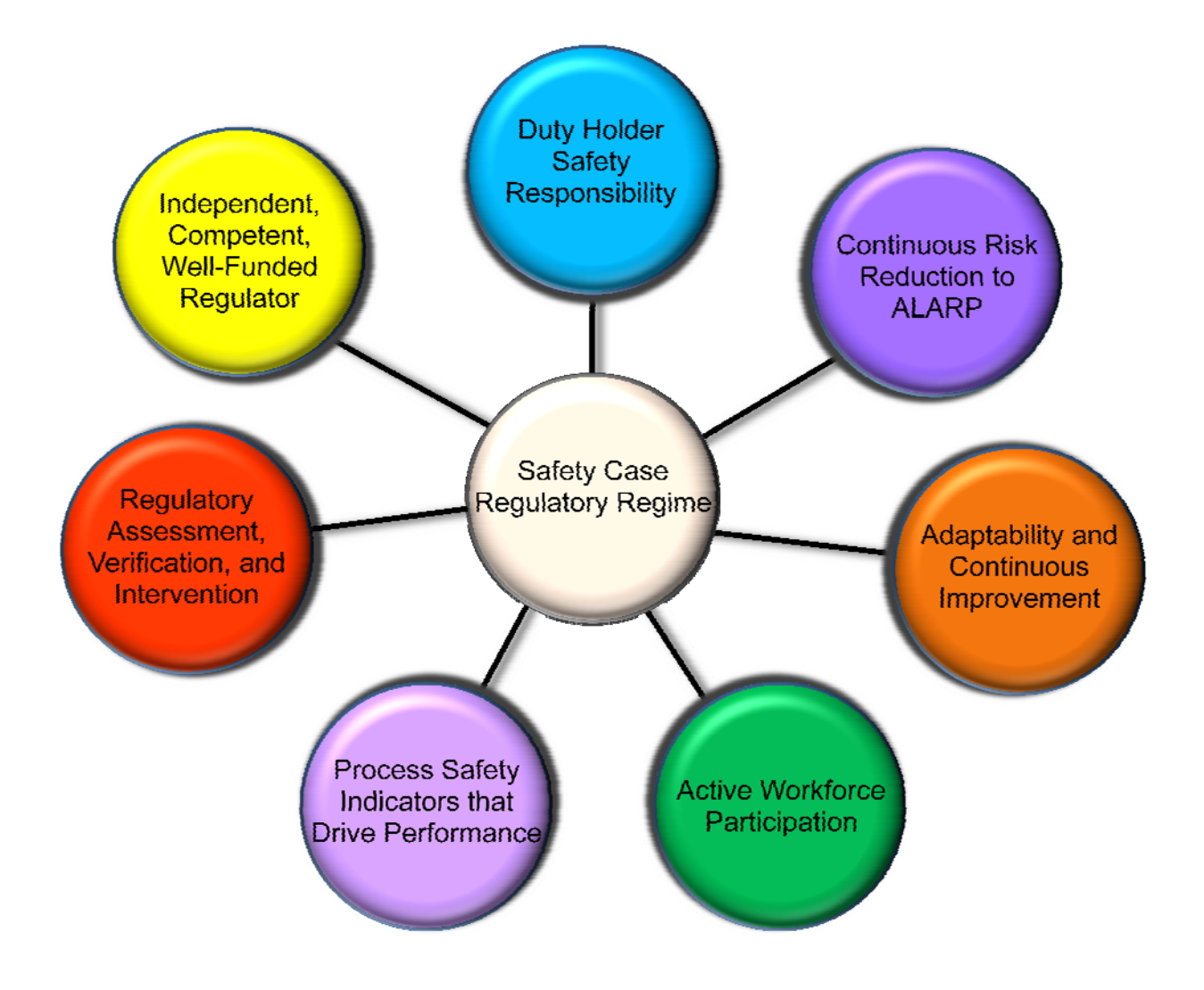
Figure 1. Safety Case Attributes.