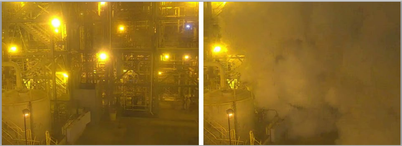
Figure 2. Surveillance images immediately before (left) and four seconds after (right) the reboiler rupture.