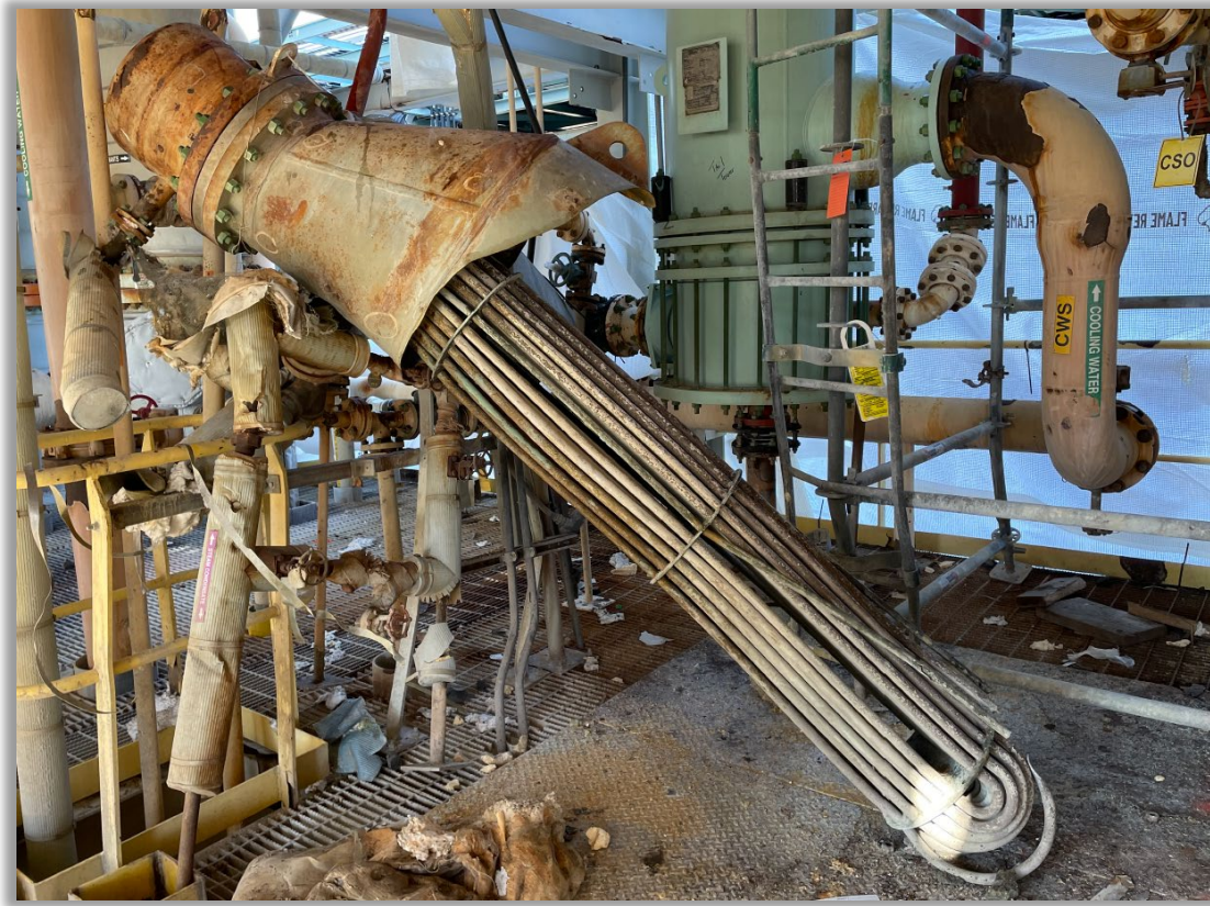
Figure 3. Post-incident image showing the remnants of the reboiler.