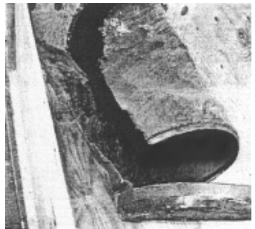
Figure 3. Ruptured 55-gallon plastic drum.

These accounts, combined with the severity and direction of the blast damage, confirm that the explosion was centered in the area where the waste consolidation had taken place.