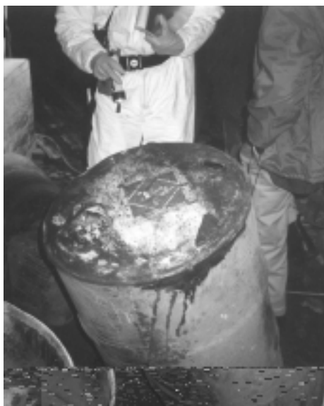
Figure 4. Bulged metal drum

CSB investigators believe that the blast knocked the metal drum over, spilling some of its flammable contents. The alcohol likely ignited and served as the source of fuel for the fire . . .