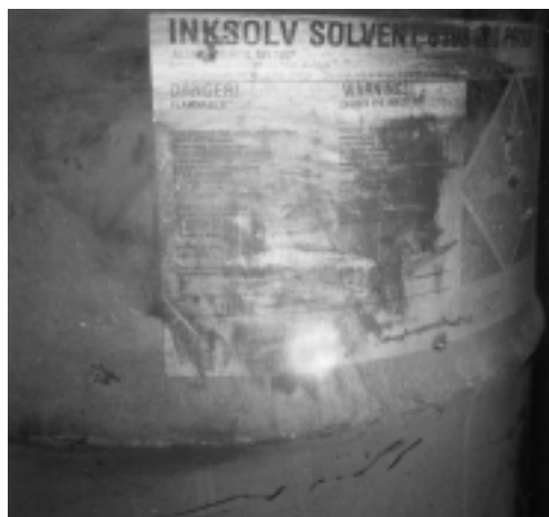
Figure 5. Legible side label on bulged drum.

CSB investigators believe that the blast knocked the metal drum over, spilling some of its flammable contents. The alcohol likely ignited and served as the source of fuel for the fire, which probably flashed back into the drum, causing an internal deflagration severe enough to distort the container. The ignition source may have been one of the many electrical devices in the general area of the consolidation.