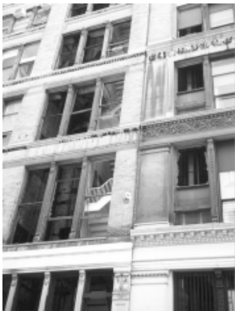
Figure 2. Front of building, windows blown out up to fifth story.

The highly confined environment of the basement offered limited pathways for the explosion pressure to vent.