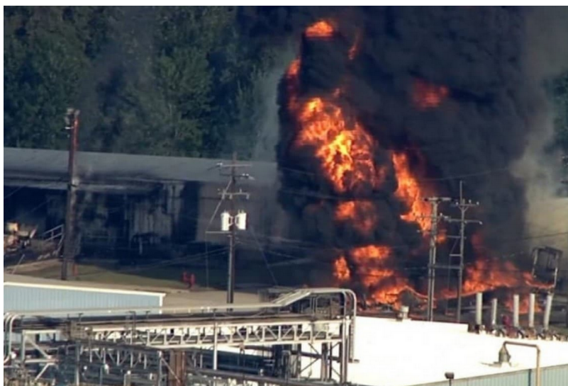
View of the 2017 fire at the Arkema Chemical Plant in Crosby, Texas

On August 31, 2017, fires erupted at the Arkema Chemical Plant in Crosby, Texas, as a result of heavy rain from Hurricane Harvey. Plant equipment flooded and failed, causing chemicals stored at the facility to decompose and burn, releasing fumes and smoke into the air. Twenty-one people sought medical attention from reported exposures to the fumes. More than 200 residents living near the facility was evacuated and could not return home for a week.