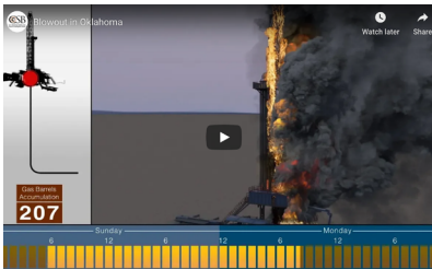
Animation still from “ Blowout in Oklahoma. ”