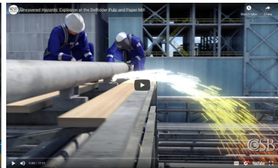
Animation still from “ Uncovered Hazards: Explosion at the DeRidder Pulp and Paper Mill. ”