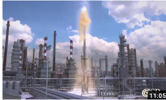
Texas City, TX