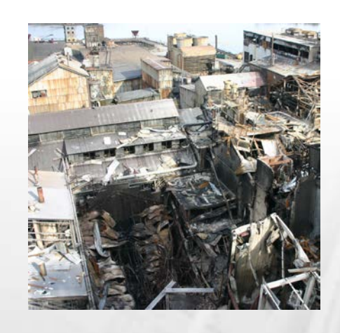
April Combustible Dust Safety