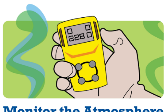
Monitor the Atmosphere