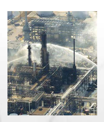
May Extreme Weather