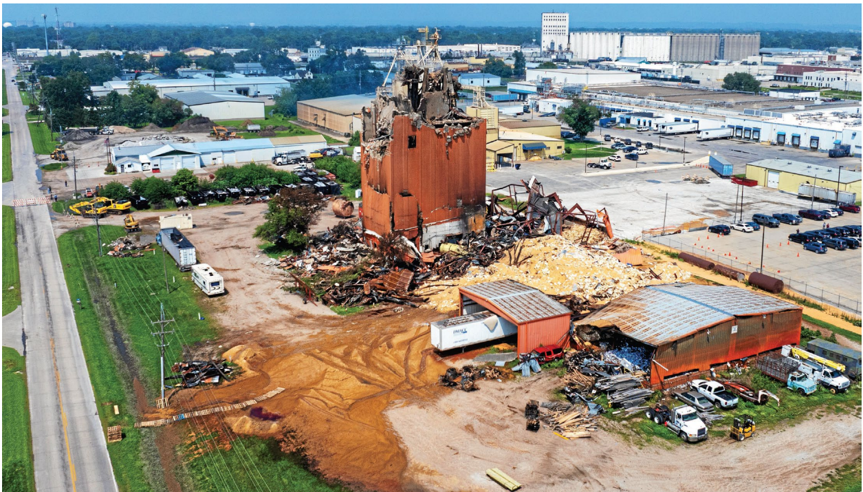
Figure 1. Post-incident image of the Horizon Biofuels facility on July 31, 2025.