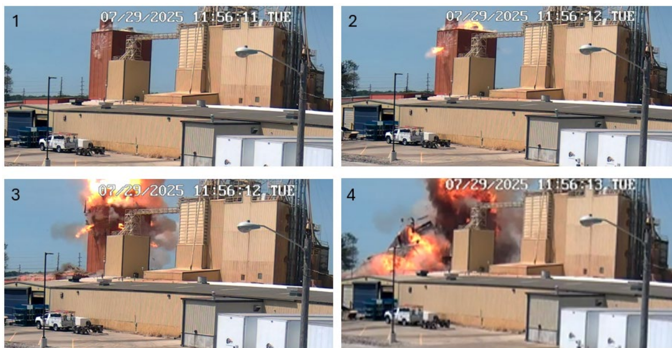
Figure 2. Video screen captures of the explosion on July 29, 2025