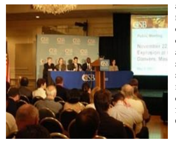
CSB public meeting.

The President appoints, and the Senate confirms, CSB board members. The board Chairperson serves as the Chief Executive Officer and is responsible for agency