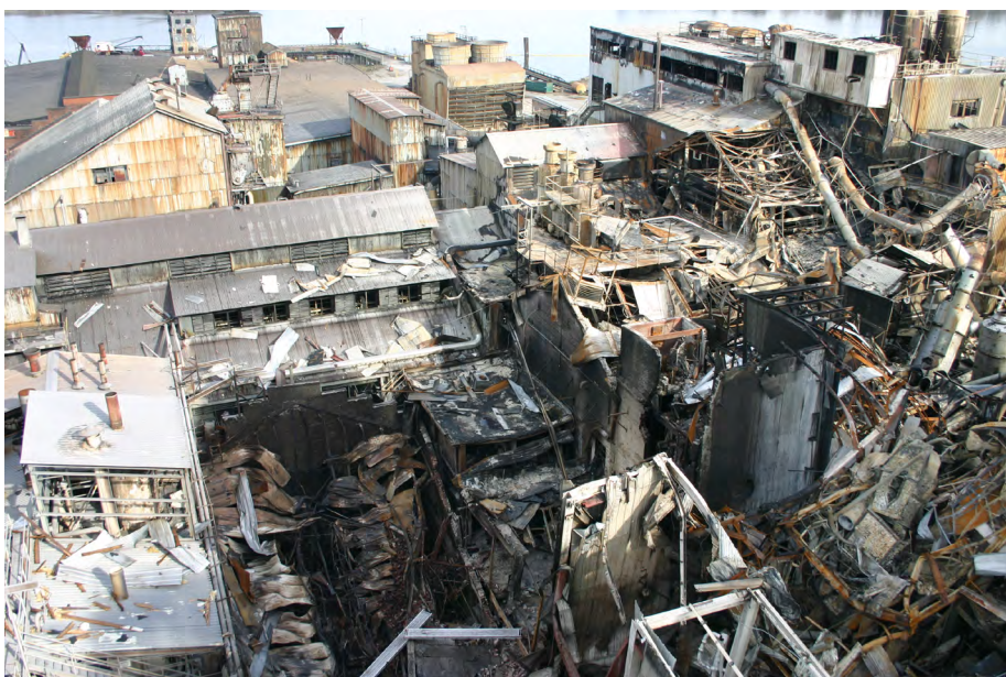
CSB Imperial Sugar Investigation, 2008

manufacturing. The 2006 Combustible Dust Study reviewed three combustible dust-related incidents over a two-year period, and identified 281 combustible dust incidents between 1980 and 2005 that killed 119 workers, injured 718, and extensively damaged industrial facilities. Since 2006, the CSB has conducted five additional investigations into dust-related incidents. These five incidents alone have taken the lives of 27 workers and injured 61 others.