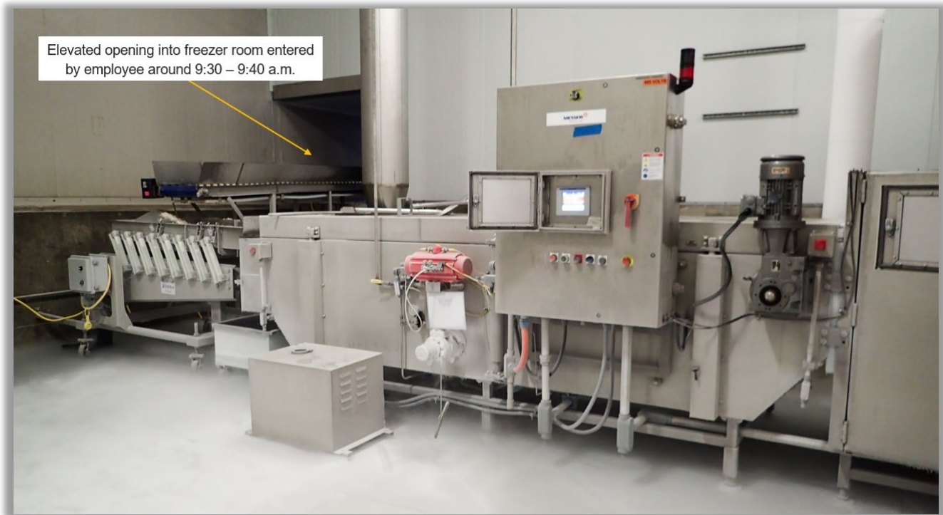
Figure 1. The Line 4 immersion freezer in the freezer room. This photo was taken soon after the incident.

On Thursday, January 28, 2021, between approximately 8:45 and 9:30 a.m., liquid nitrogen was released from a freezer located in Plant Four at the Foundation Food Group (“FFG”) facility in Gainesville, Georgia ( Figure 1 ), resulting in the fatal injuries of six employees and the serious injury of three employees and one emergency responder. Once released, the liquid nitrogen quickly vaporized, expanded, and accumulated inside a partially enclosed room within a building. FFG used liquid nitrogen for the freezing of cooked poultry products.