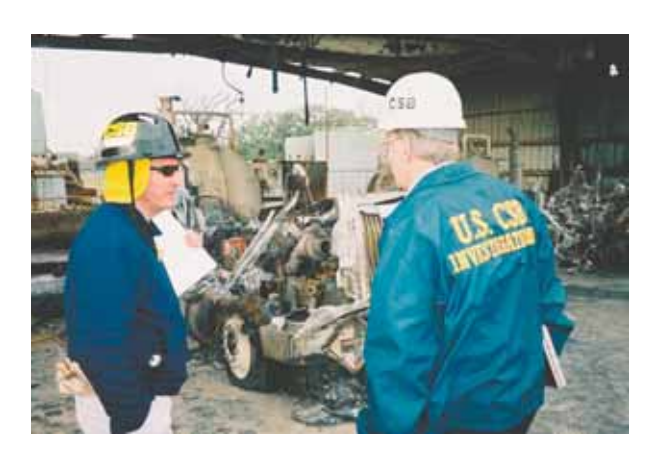
Members of a CSB investigation team survey the scene of a fatal vapor cloud fire in Rosharon, Texas.

eligibility for retirement, succession planning takes on heightened importance. Developing plans for replacing key investigative and administrative functions will be an important exercise during the current period.