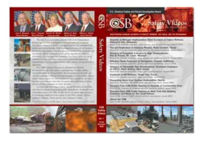
The CSB Safety Videos DVD details recommendations issued from recent CSB investigations in a series of short videos.

In the past several years, the CSB has moved toward virtually 100% electronic dissemination of all its information. The CSB's website, CSB.gov, is an internationally recognized resource for accident prevention that receives more than one million hits annually. The site, which was completely redesigned in 2003, is the agency's principal interface with the public. The Strategic Plan envisions continued investment in the website to maintain its currency, including state-of-the-art technologies such as imbedded streaming video. As technologies evolve we will utilize those new technologies to extend the dissemination of CSB safety findings.