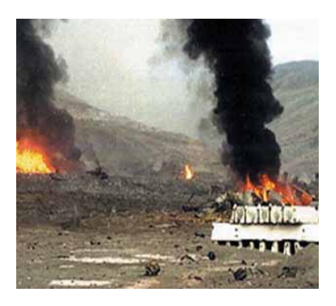
In January 1998, two massive explosions just seconds apart destroyed an explosives manufacturing plant ten miles east of Reno, Nevada.

During the period from July 2004 to June 2005, the agency initiated five accident investigations; all five scored at least "medium" in the agency's selection criteria. During the same period, resource constraints prevented the agency from deploying investigators to eight other accidents that scored "medium" or above.